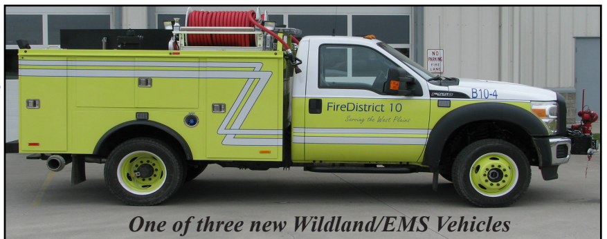
One of three new Wildland/EMS Vehicles