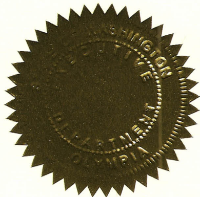
Governor Christine O. Gregoire

A handwritten signature in blue ink that reads "Christine Gregoire".